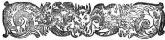
ILLUSTRATION TO VOL. XIX