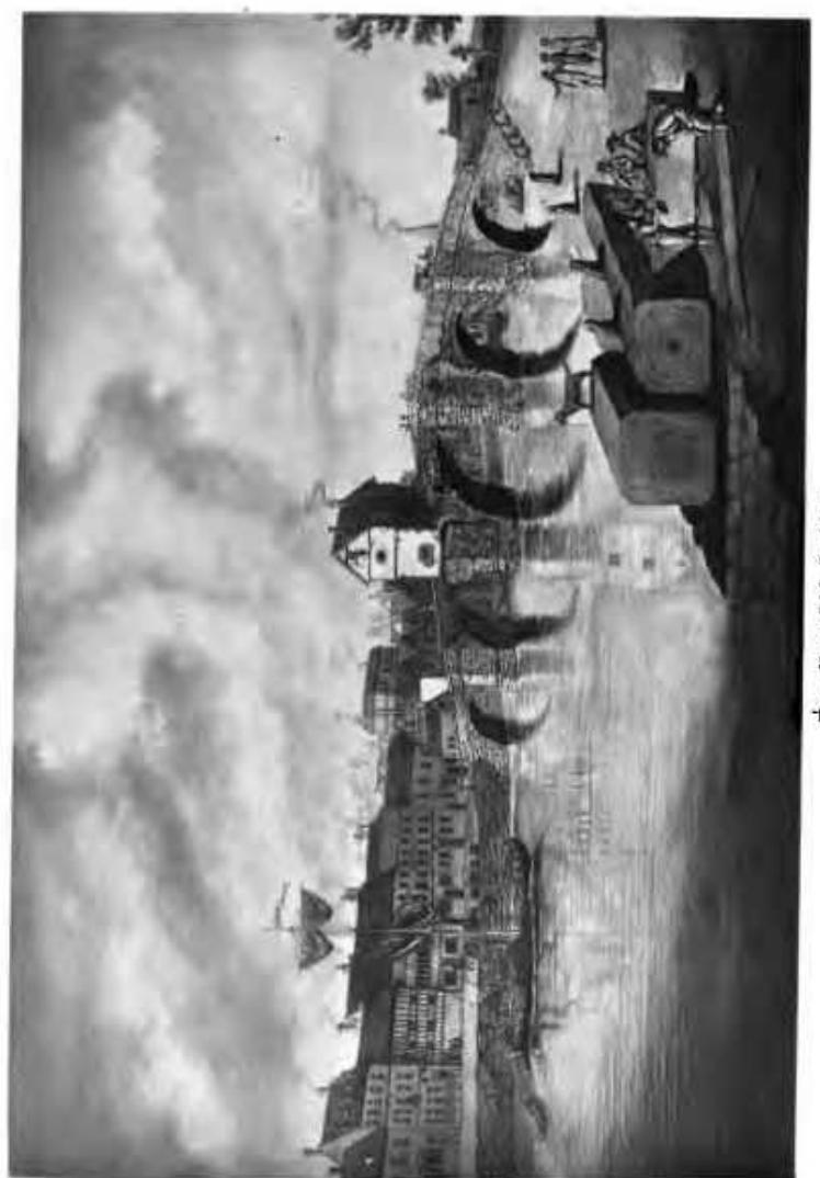
Bewdley Old Bridge.