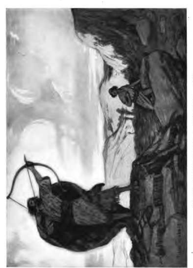
THE PRINCE SHOT THE ARROWS BEYOND HIM (page 137)