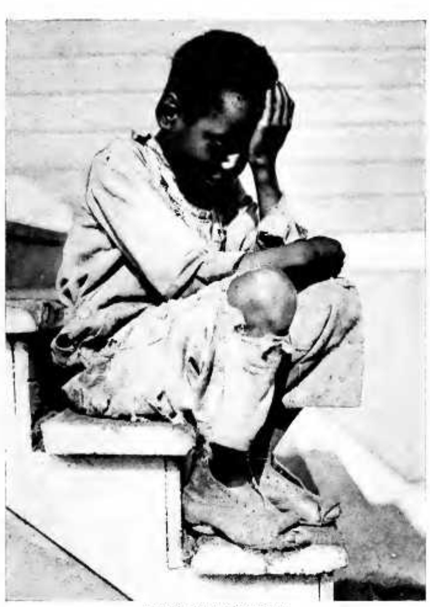
LOST IN THOUGHT Perhaps he is wondering what the future holds in store for him.