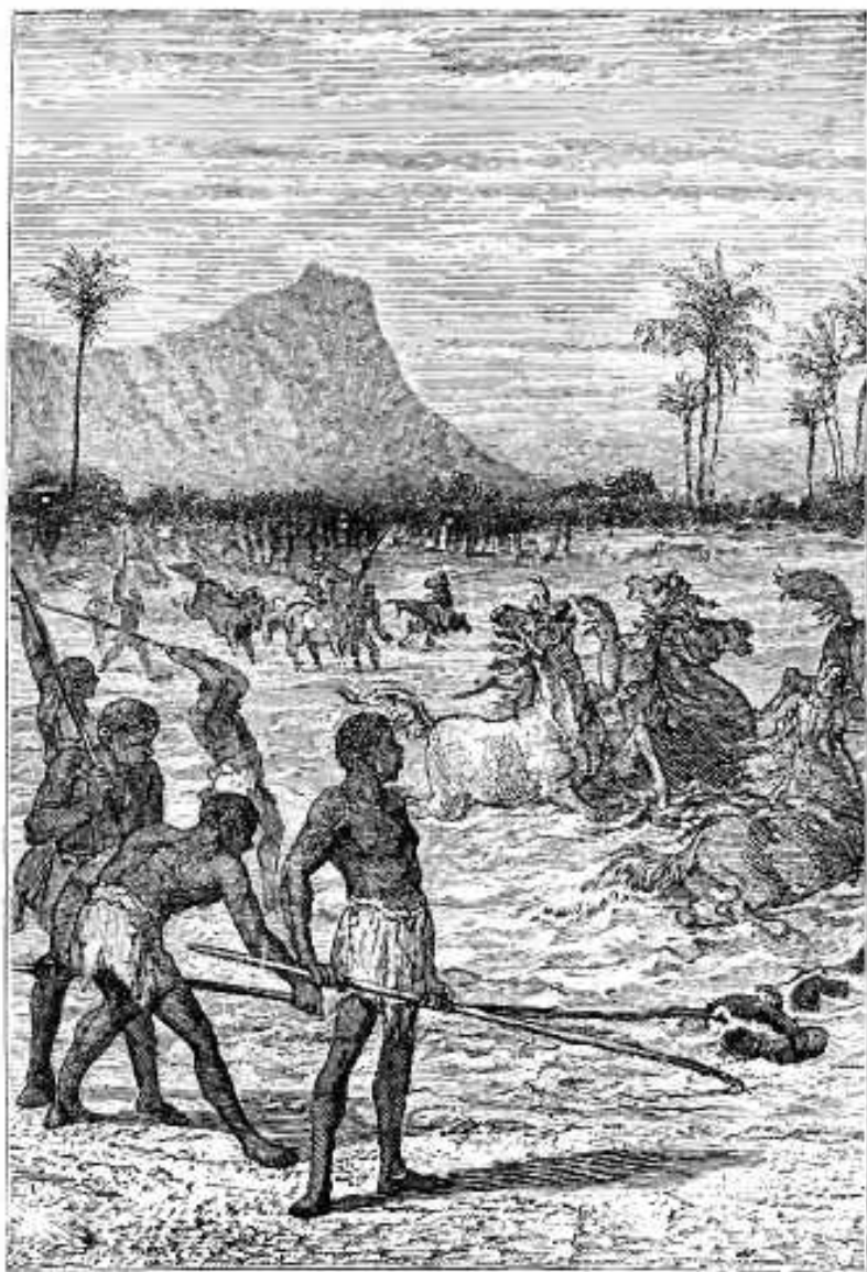
FISHING FOR ELECTRIC EELS.