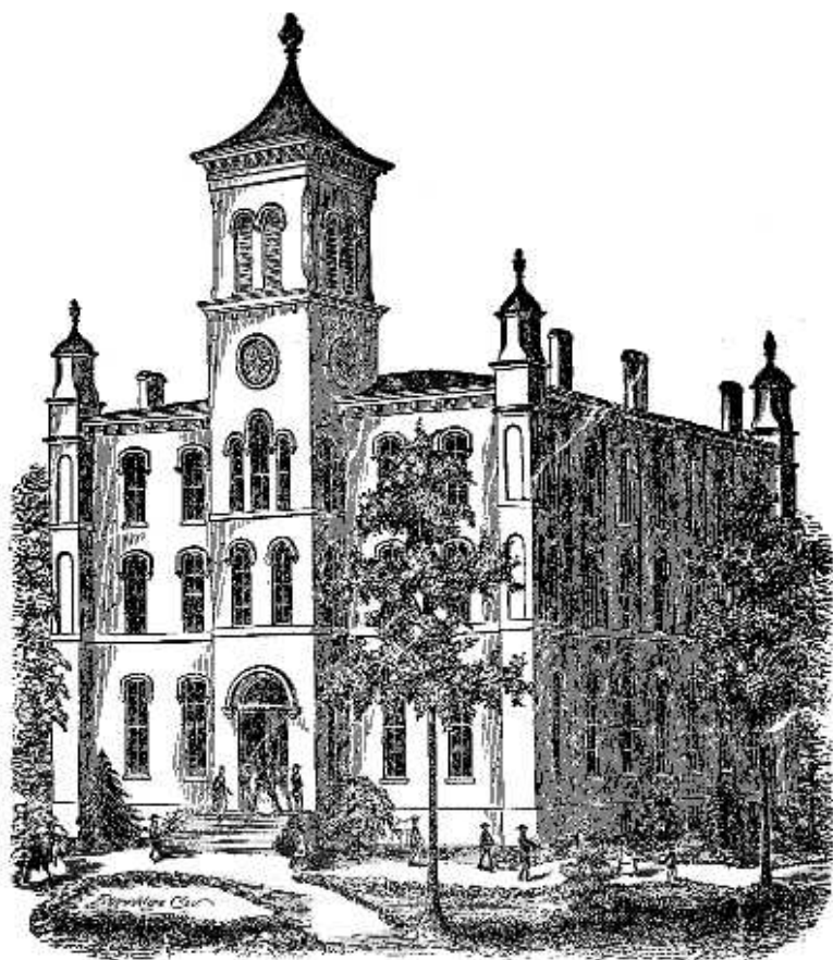
WILLOUGHBY COLLEGE (1865.)

To the Students of the past and present, of those public life, labors and prayers, this