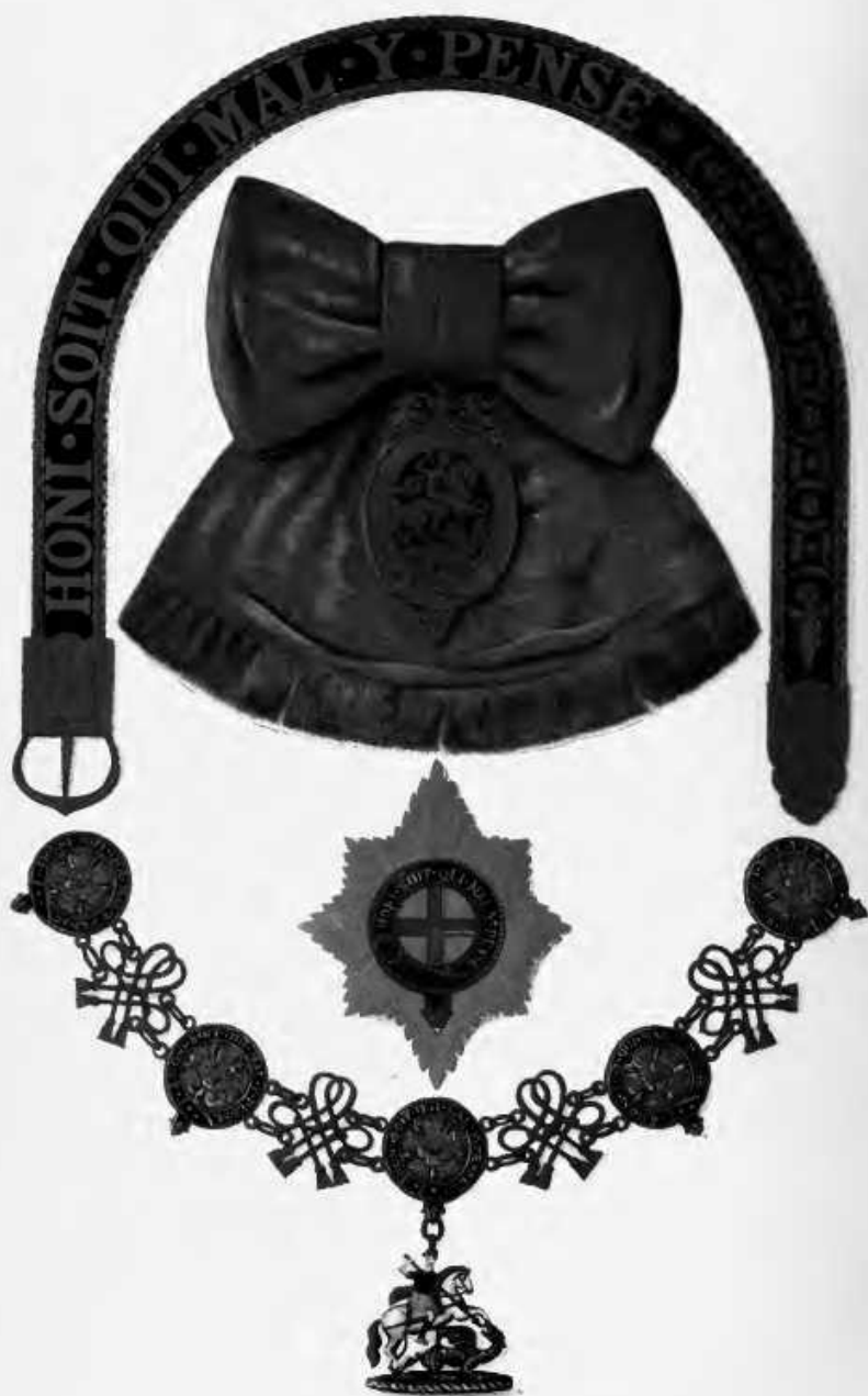
THE INSIGNIA OF THE MOST NOBLE ORDER OF THE GARTER.