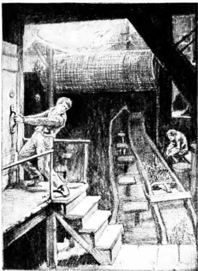
IN THE BURNING BREAKER