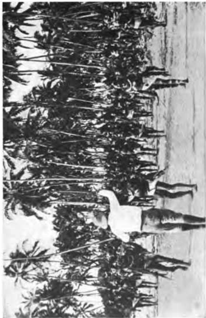
"Uhmen!" From their manner it is evident that we are de trop