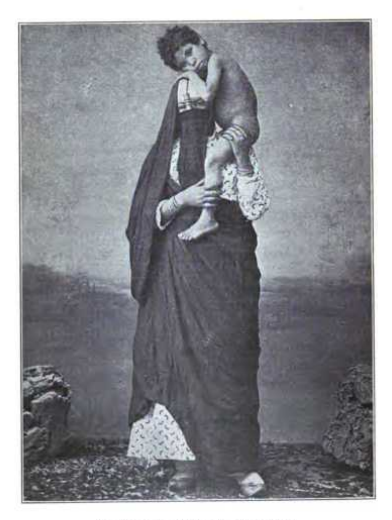
An Egyptian Woman and Child