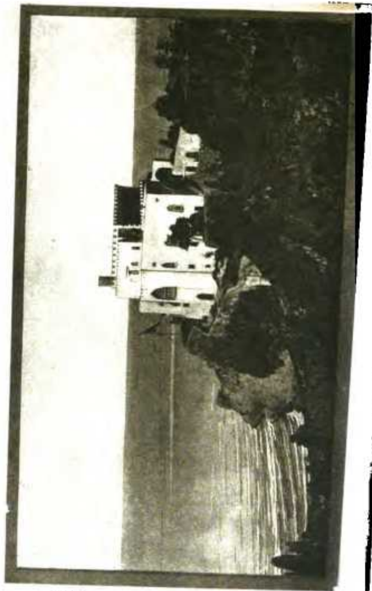
CASTELLO MEZZATORRE PAGE 162