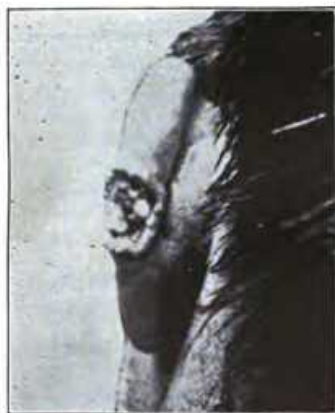
FIG. 2. Ulcerating Epithelioma of the Ear: from photograph by the Author.