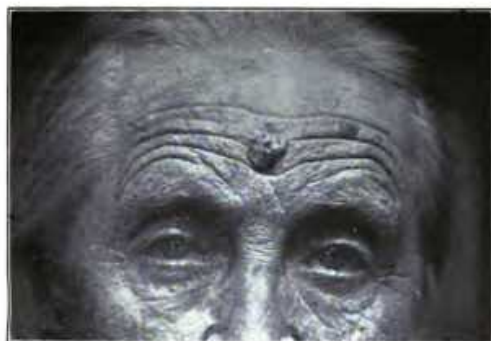
FIG. 1. Papillary Epithelioma of the Forehead: from photograph by the Author.