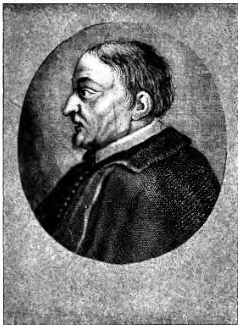
Miguel de Molinos