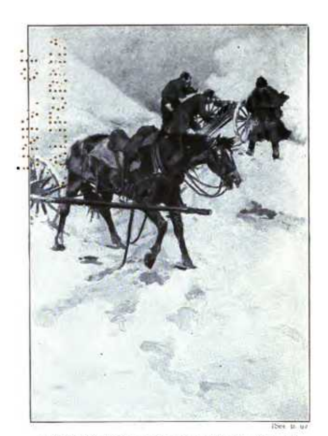
"THEY SENT SHELL AFTER SHELL INTO THE VILLAGE"