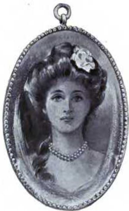
Miss Washington of Virginia