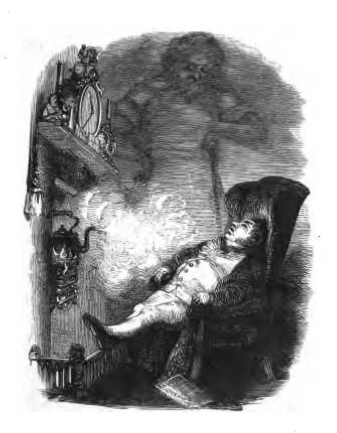
MR. BULL AND THE GLART,