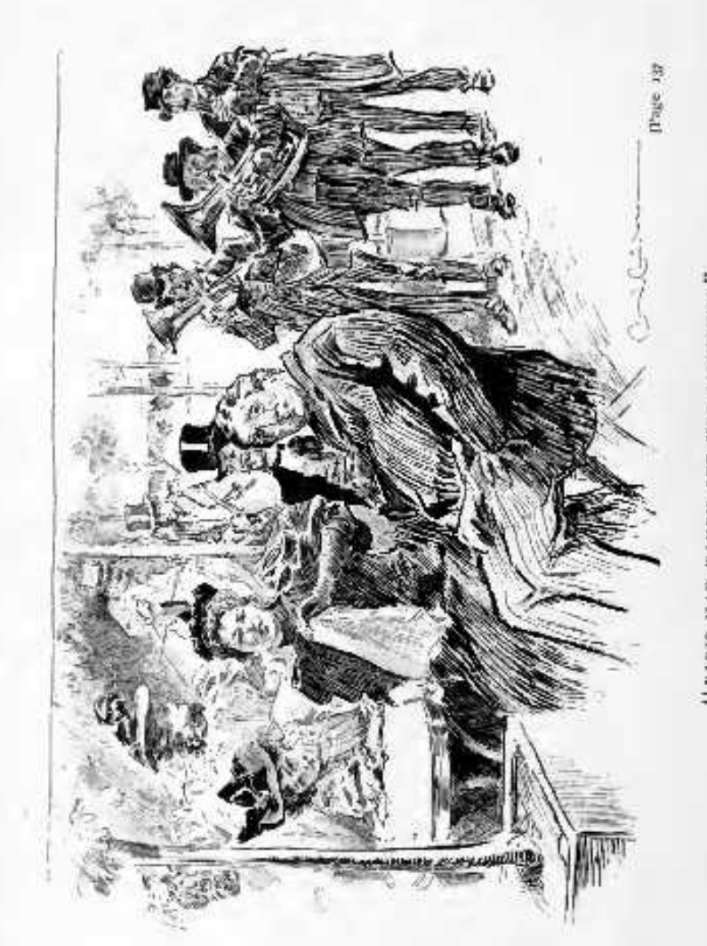
"PARIS HAD TAKEN OFF HER MOURNING"