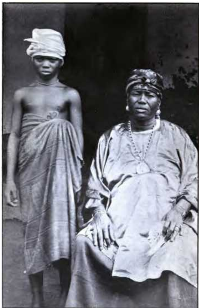
MADAM YOKO, OUR PARAMOUNT CHIEFTAINESS, MENDI TRIBE