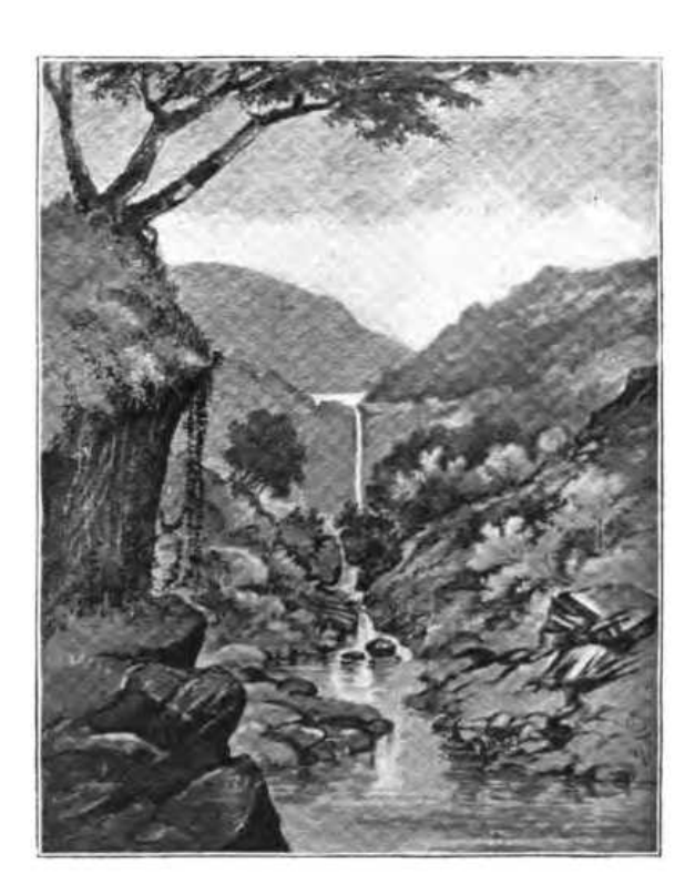
"AND STREAMS RAN FROM IT DOWN THE ROCK-RIBBED HILLS."