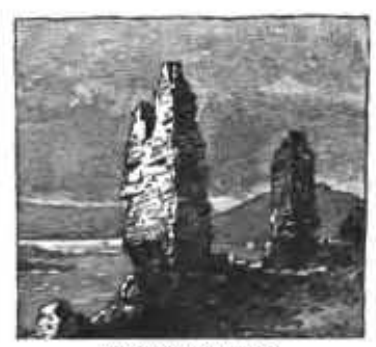
BUTHS OF TECONDREGGA