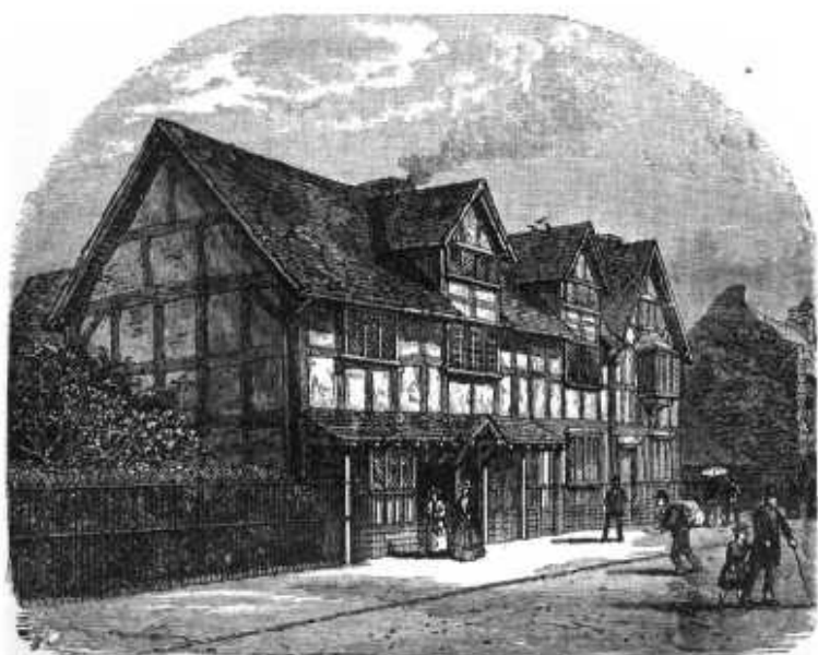
THE SHAKESPEARE HOUSE RESTORED.