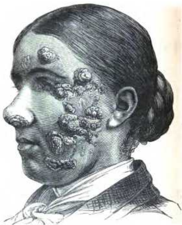
BULLOUS SYPHILIDE ( Vide page 121).