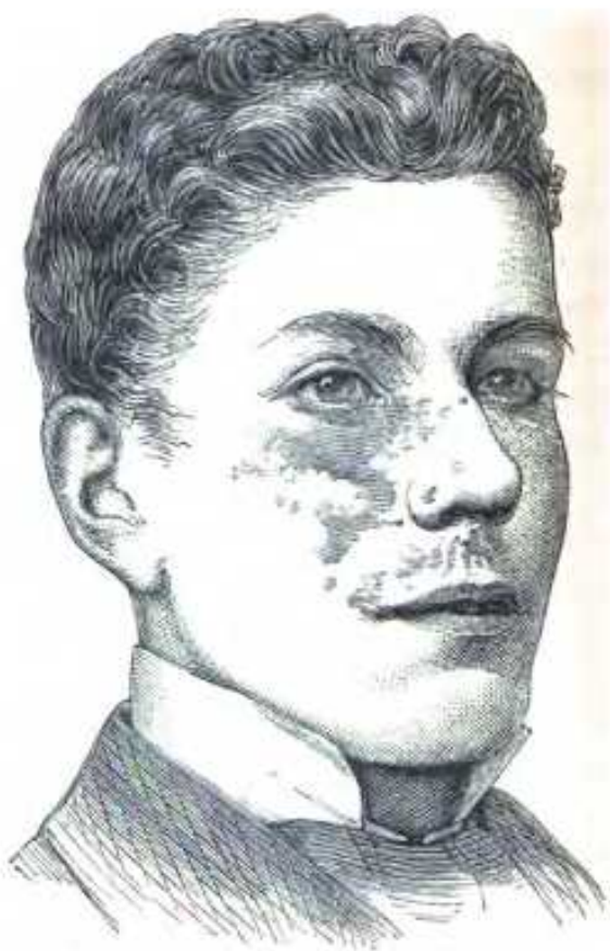
PORT-WINE-MARK ( Vide page 93).