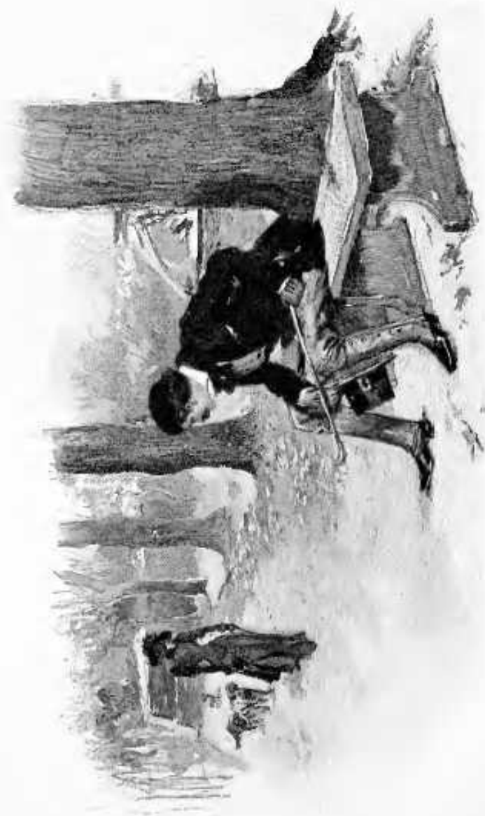
"WALKING AWAY WITH A SHRUG OF THE SHOULDERS."