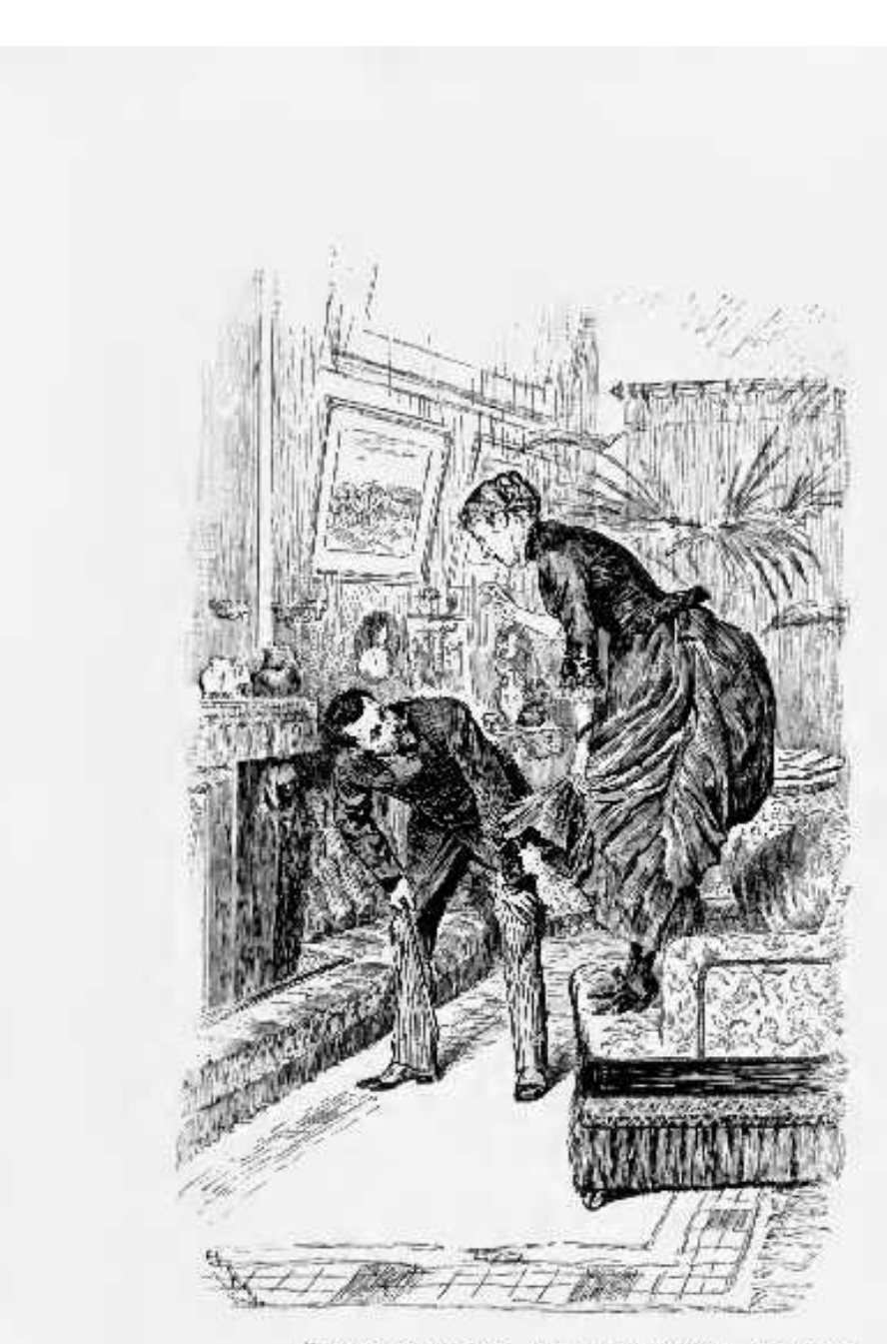
"THERE NEVER WAS ANY MOUSE HERE." [Page 129.