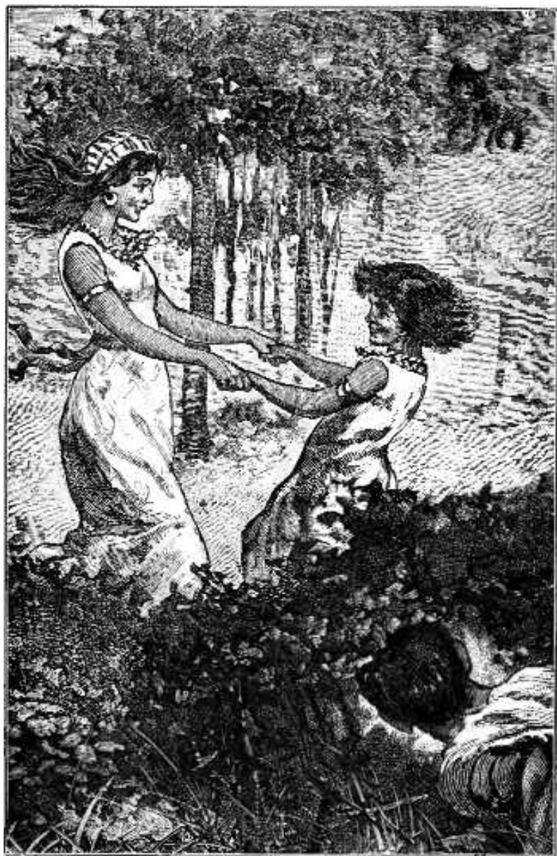
SNAKES IN THE GRASS.—PAGE 151. (Frontispiece.)