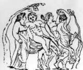
Bacchus and Nymphs.