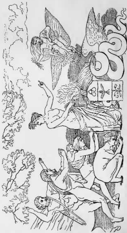
Eleusinian Ceremony.—Denkmäler Sculptur.