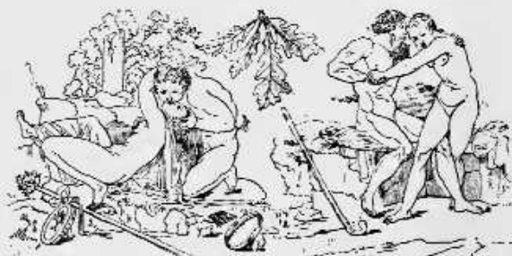
Bacchante and Faun.