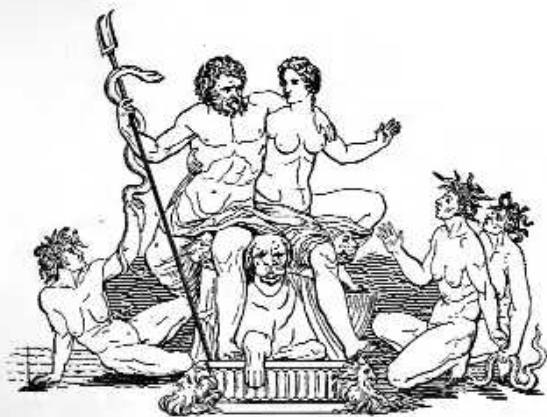
Pluto, Proserpina, and Furies.