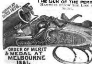
THE GUN OF THE PERIOD. HARRIS'S PATENT. THE LINE OF SIGHT.

ORDER OF MERIT & MEDAL AT MELBOURNE 1881.