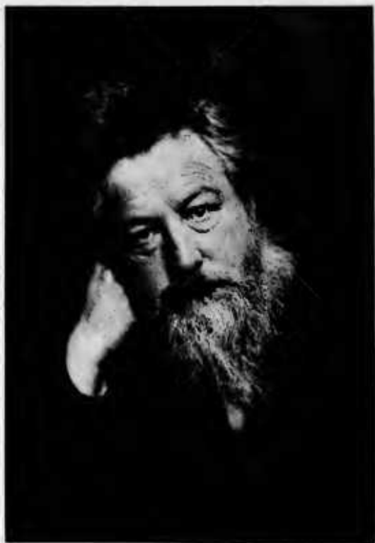
William Morris.