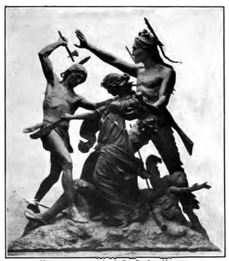
Monument commemorating the Fort Dearborn Massacre