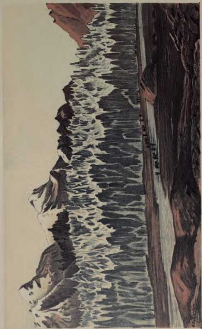
LOWER KUMDAN GLACIER - SHYOK