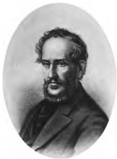
John Howard Payne