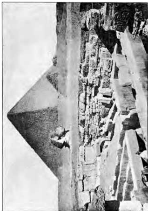
Sphinx and Pyramids