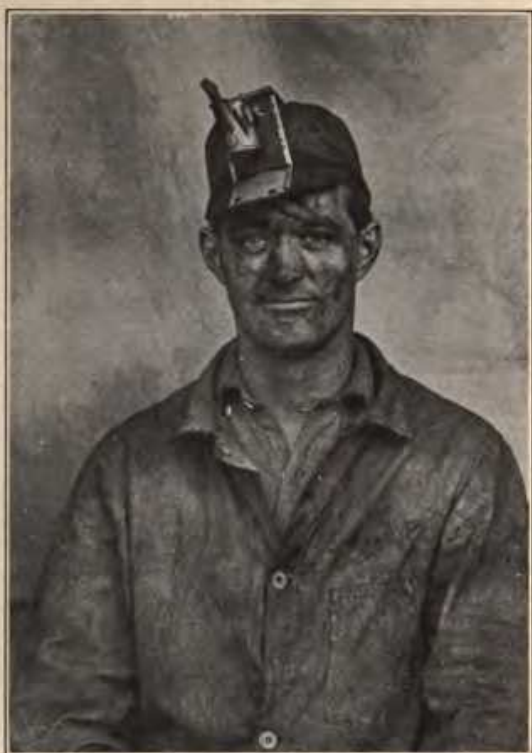
PORTRAIT OF THE AUTHOR