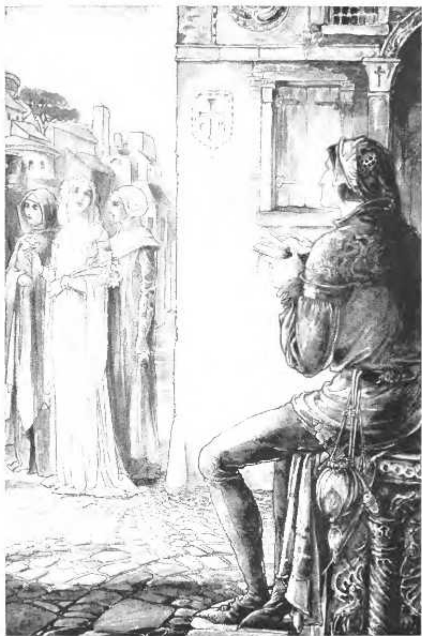
The Second Meeting of Dante and Beatrice.