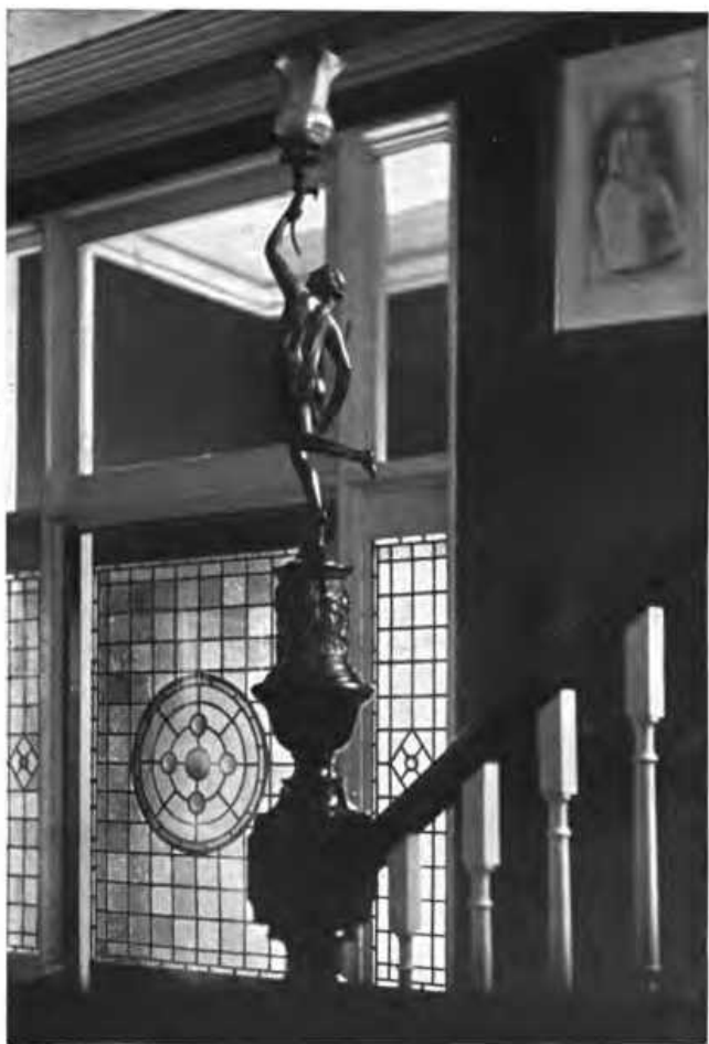
Bronze Statuette for Gas. Circa 1850.