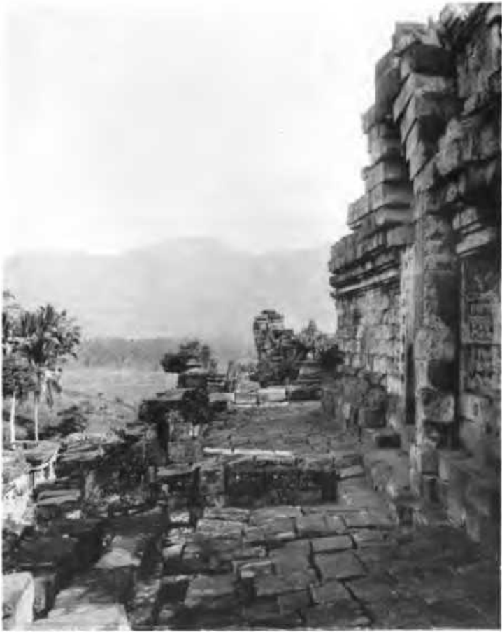
BARUBODOER, THE HOUSE OF MANY BUDDHAS