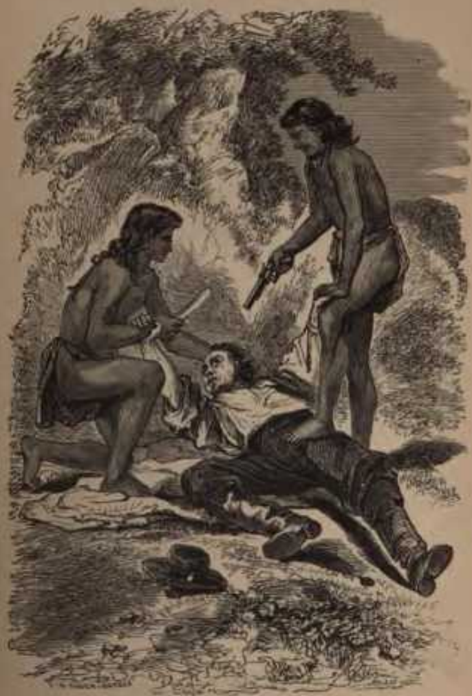
THE DEATH OF JOHNSON IN COLORADO.