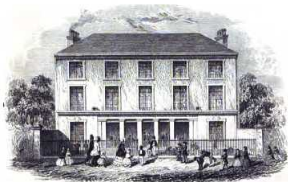
FREE ST. PAUL'S DISTRICT SCHOOL.