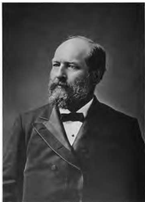
GENERAL JAS A. GARFIELD.