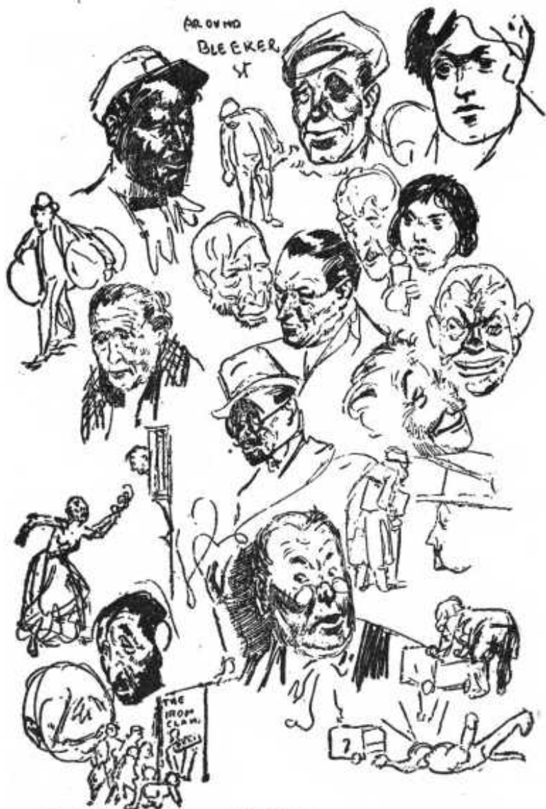
A Few Natives of Greenwich Village as Observed by Jack Flanagan