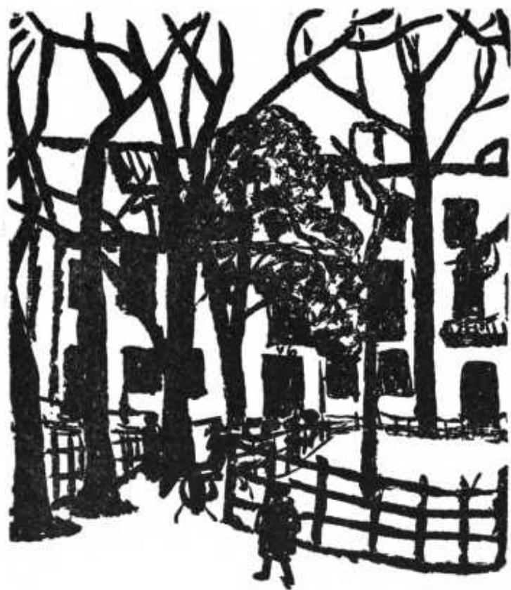
Washington Square by Ben Benn