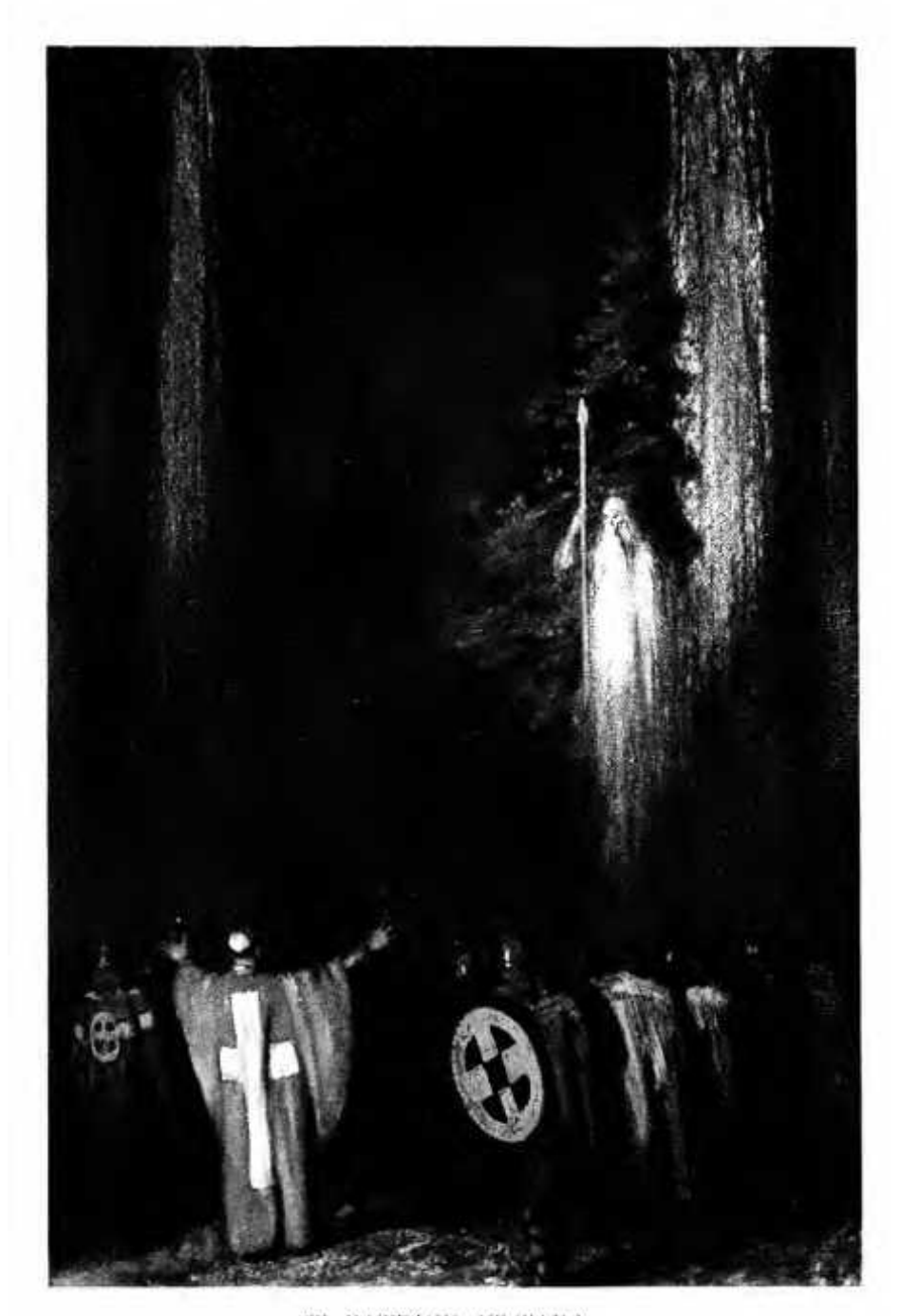
ST. PATRICK AT TARA THE APPARITION OF CUCHULAINN