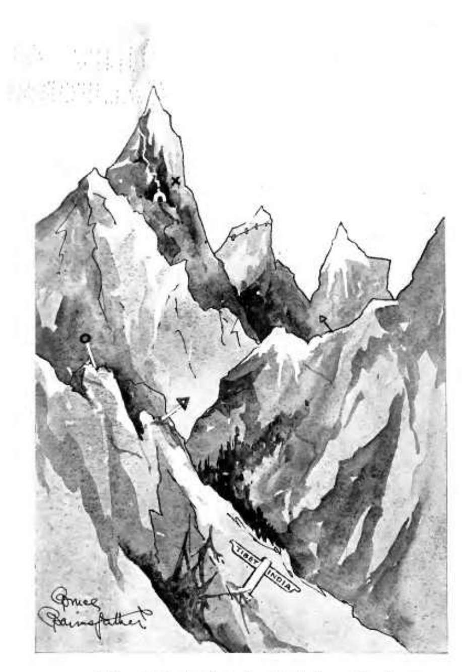
\Lambda Cross Marks the Spot where the Body was Found