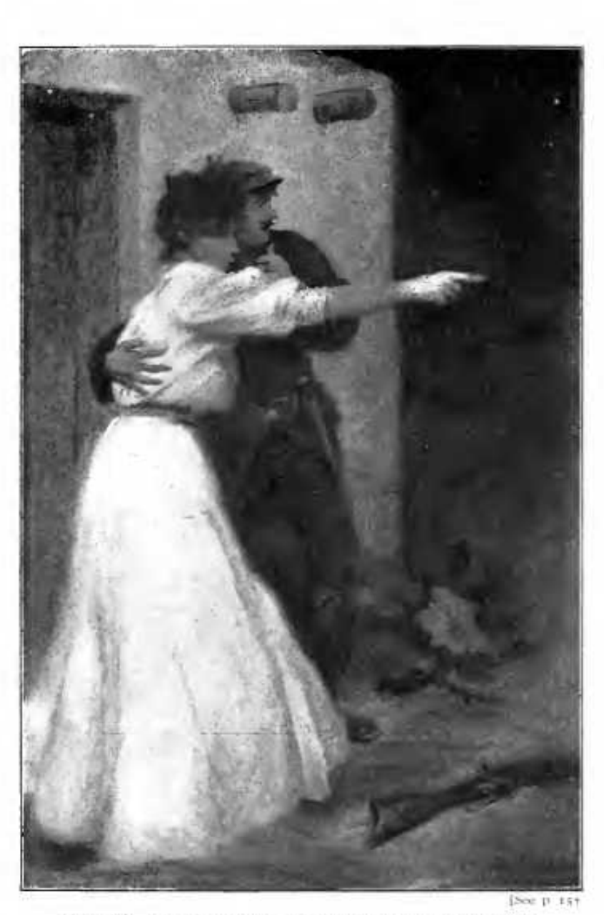
"LOOK! LOOK! THERE BY THOSE LITTLE BUSHES!"