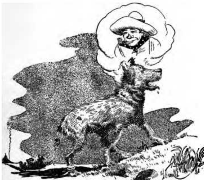
The Coyote, the Cur and Chip Moseby