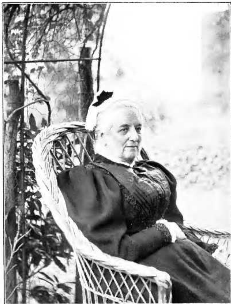
CHARLOTTE MARY YONGE.