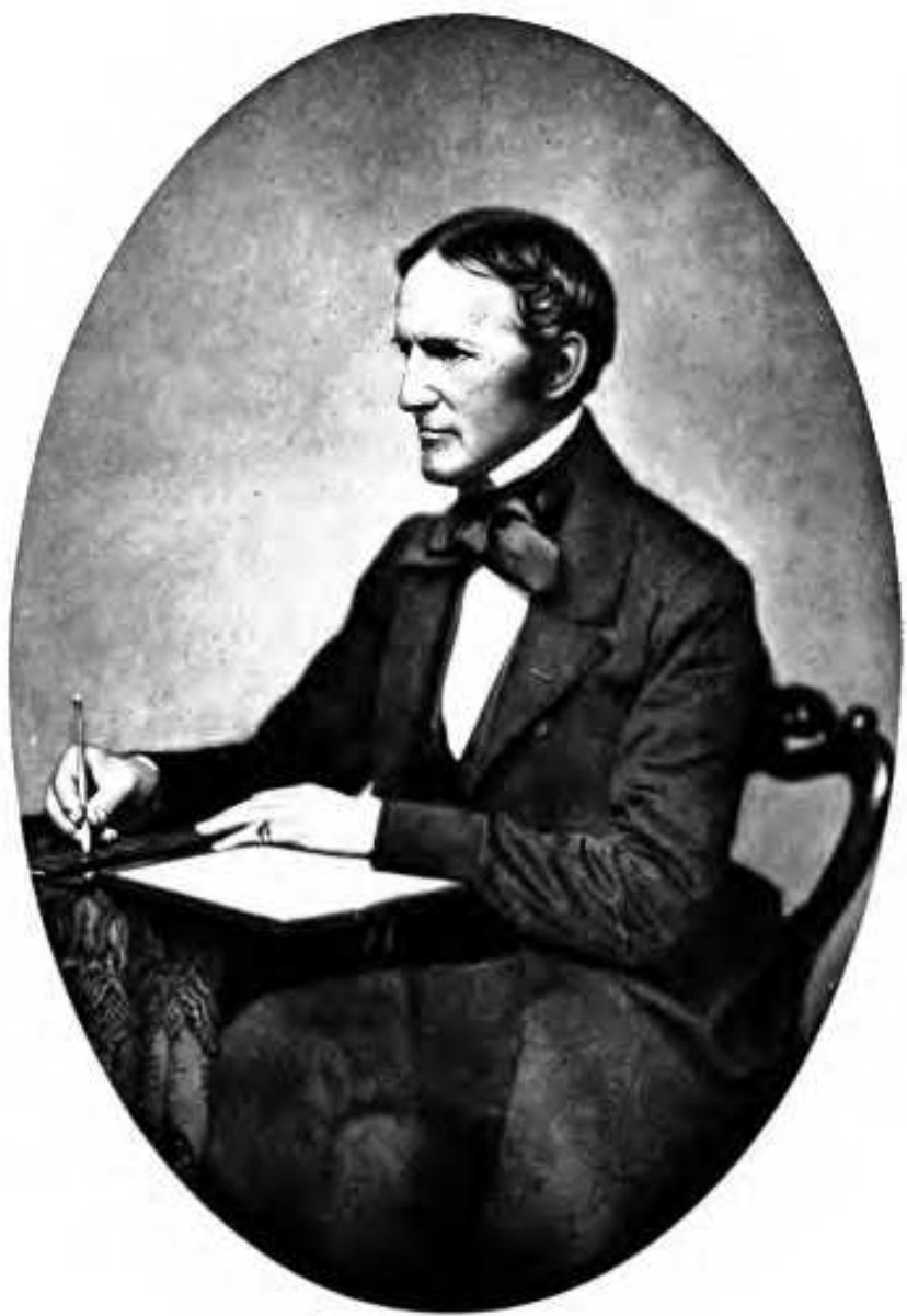
Wm. H. Prescott