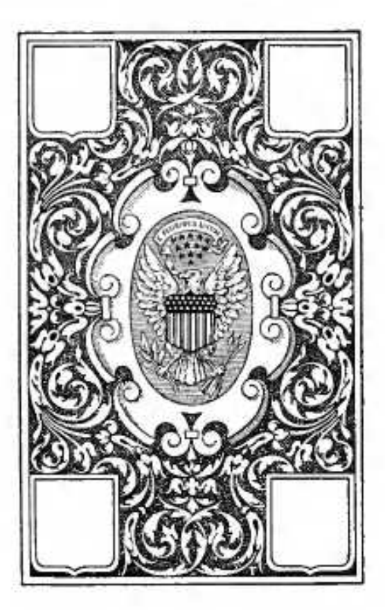
TORONTO: GLASGOW, BROOK & CO. NEW YORK: UNITED STATES PUBLISHERS ASSOCIATION, INC.

A CHRONICLE OF THE WINNING OF THE SOUTHWEST BY NATHANIEL W. STEPHENSON