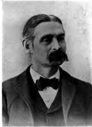
Isaac Newton Lewis.