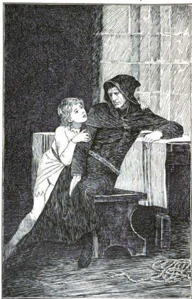
PRINCE ARTHUR AND HUBERT. (See page 72.)

From a photograph of a painting by Yeames.