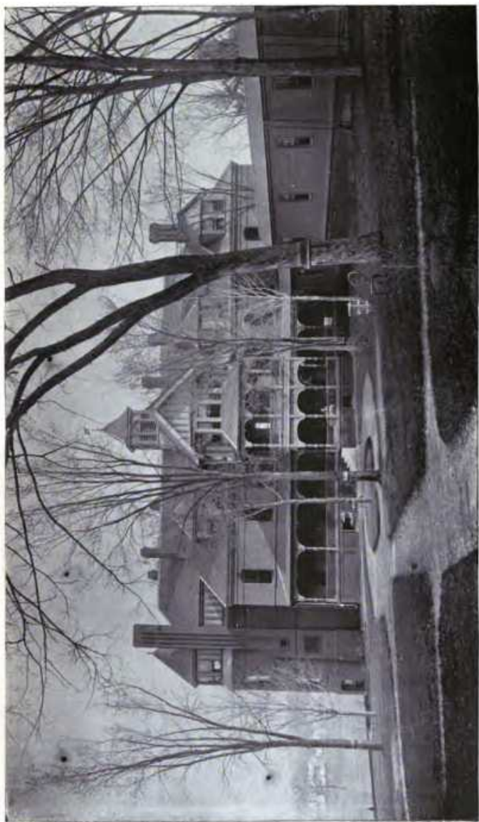
BANCROFT BUILDING—FROM THE NORTH.