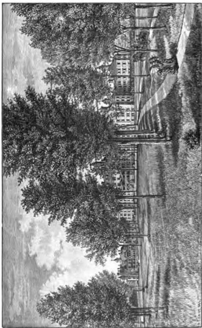
NEW HAMPSHIRE ASYLUM FOR THE INSANE.